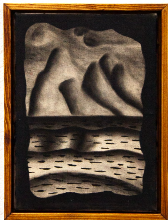
The Morning Sun, 2024 oil on canvas 29 x 21 cm