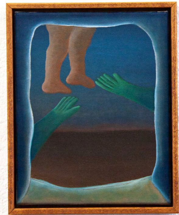
Will i see you again, 2024 oil on canvas 30 x 24 cm