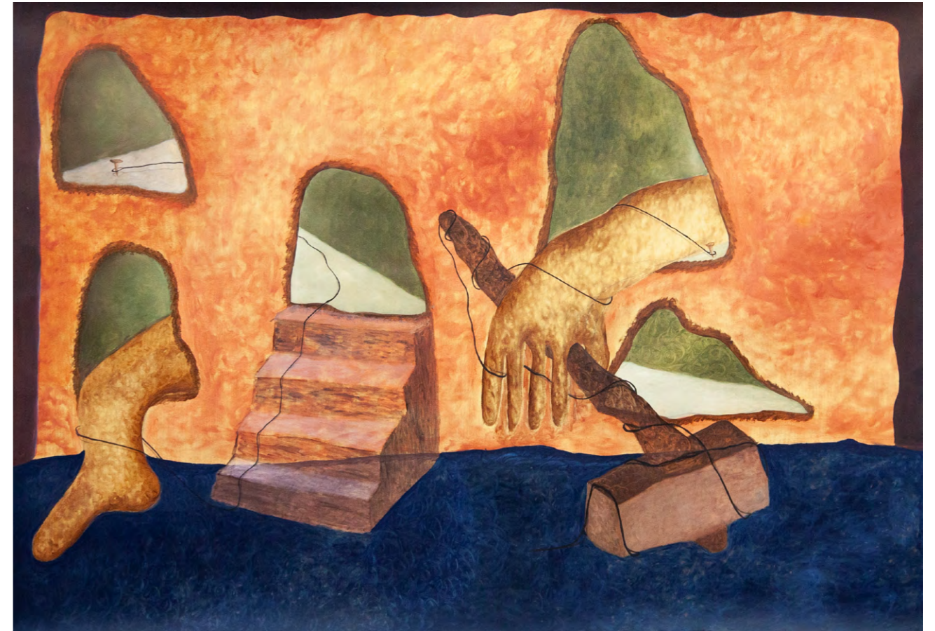
Everything comes to an end, 2024 oil on canvas 120 x 180 cm