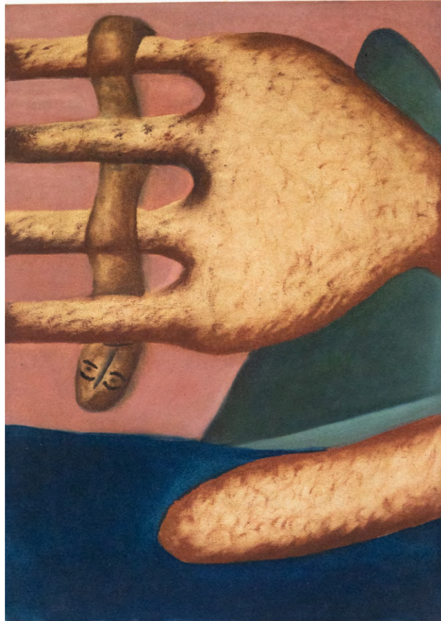
The last bite, 2024 oil on canvas 42 x 30 cm