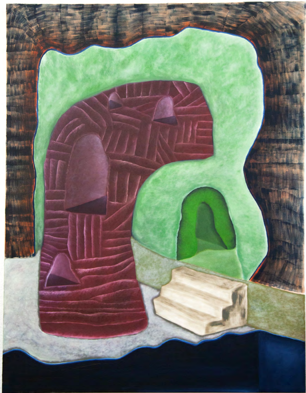
Homestory VI, 2024 oil on canvas 160 x 120 cm