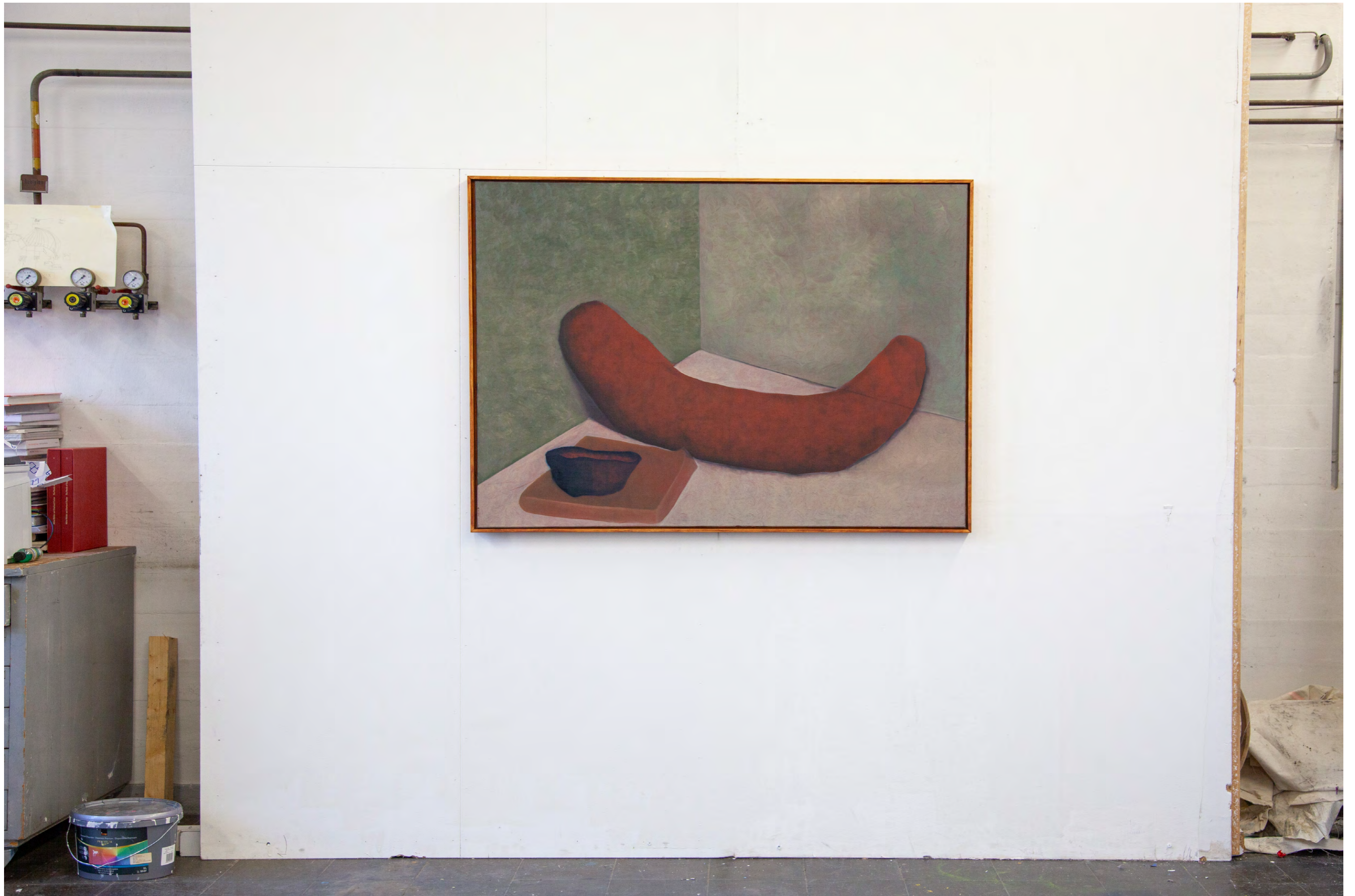
Studio view: Wake me up when its over , 2023, oil on canvas, 100 x 130 cm / Credits: Diego Kohli