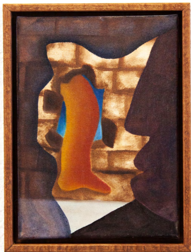
Untitled, 2024 oil on canvas 18 x 25 cm