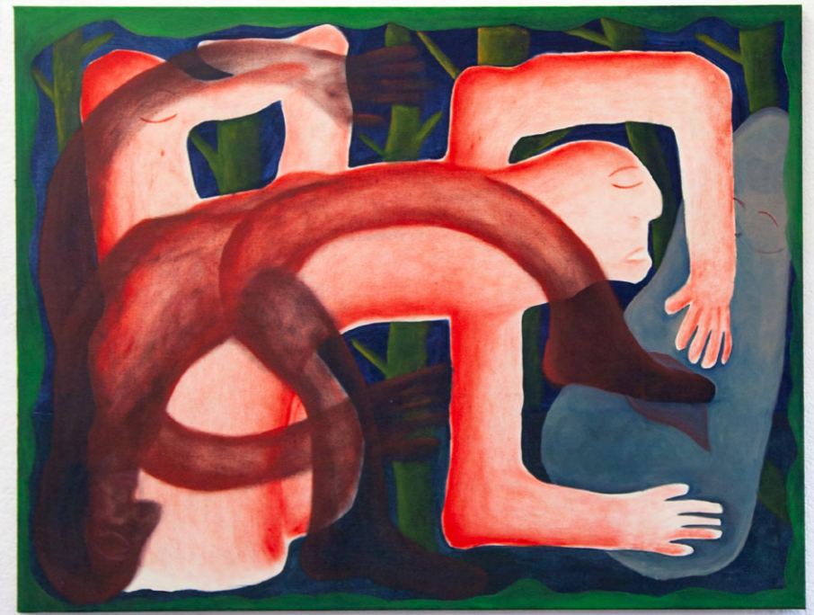
Run trough the jungle, 2024 oil on canvas 100 x 130 cm