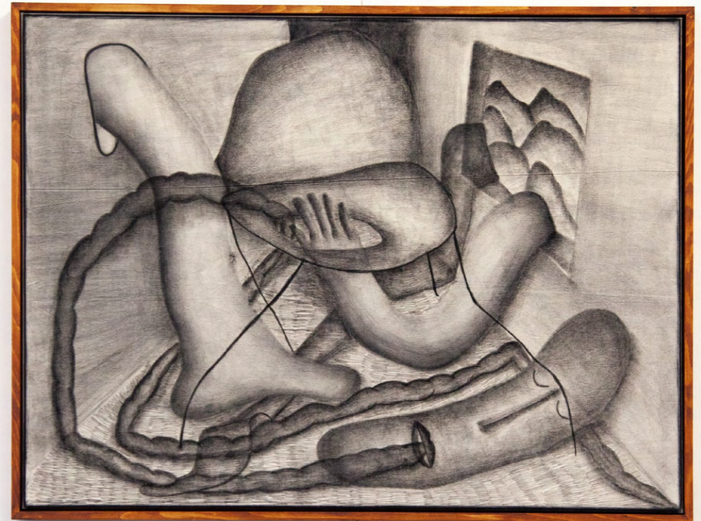
Fiasko, 2023 charcoal on cotton 90 x 120 cm