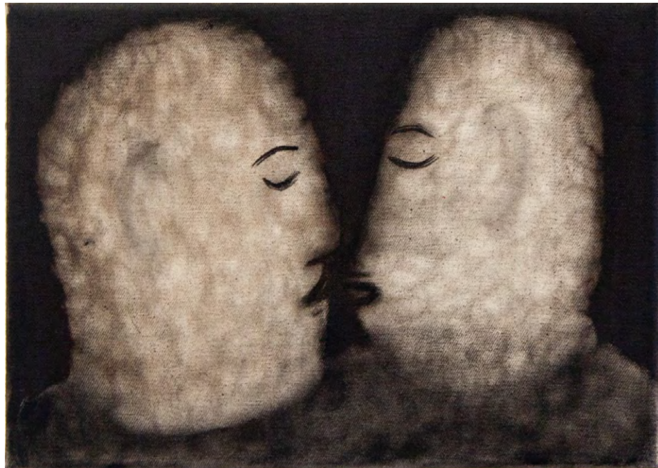
Let's dream about, 2024 oil on canvas 18 x 25 cm