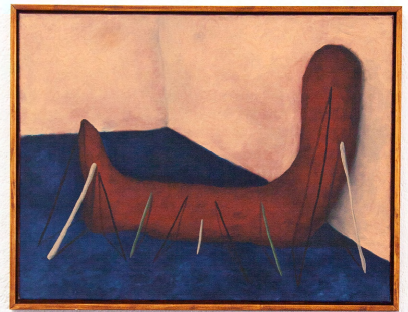
Homestory III, 2024 oil on canvas 50 x 65 cm