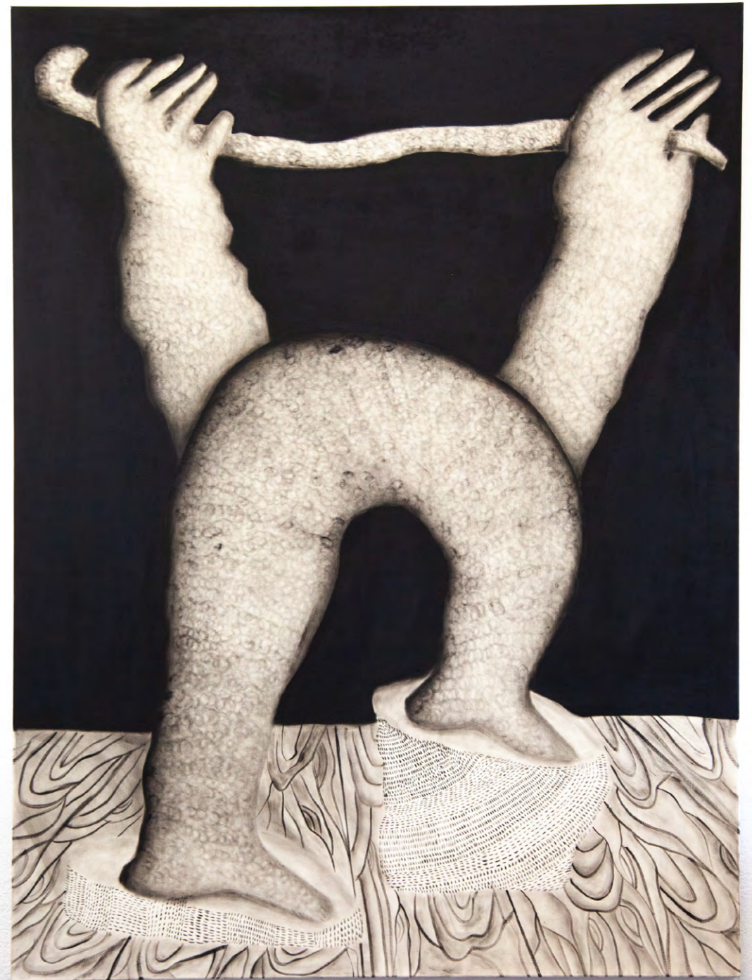
Lifebalance, 2024 oil on canvas 180 x 120 cm