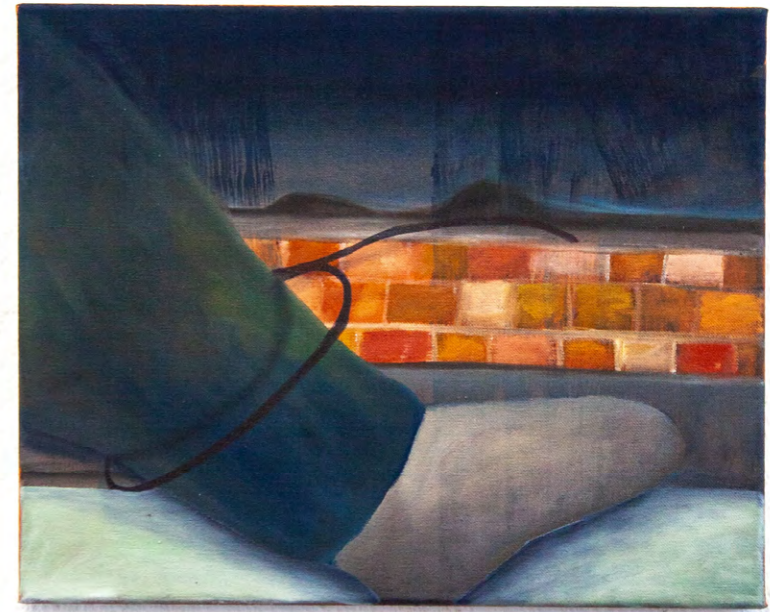
Lets dream about, 2024 oil on canvas 36 x 50 cm