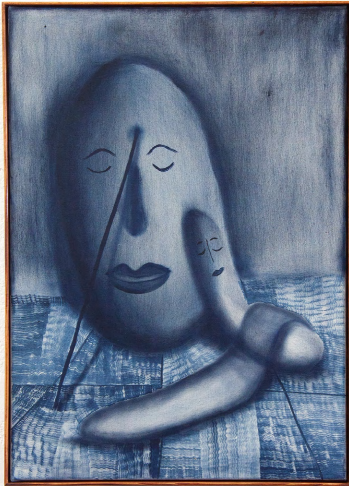
Bodgeón, 2024 oil on canvas 70 x 50 cm