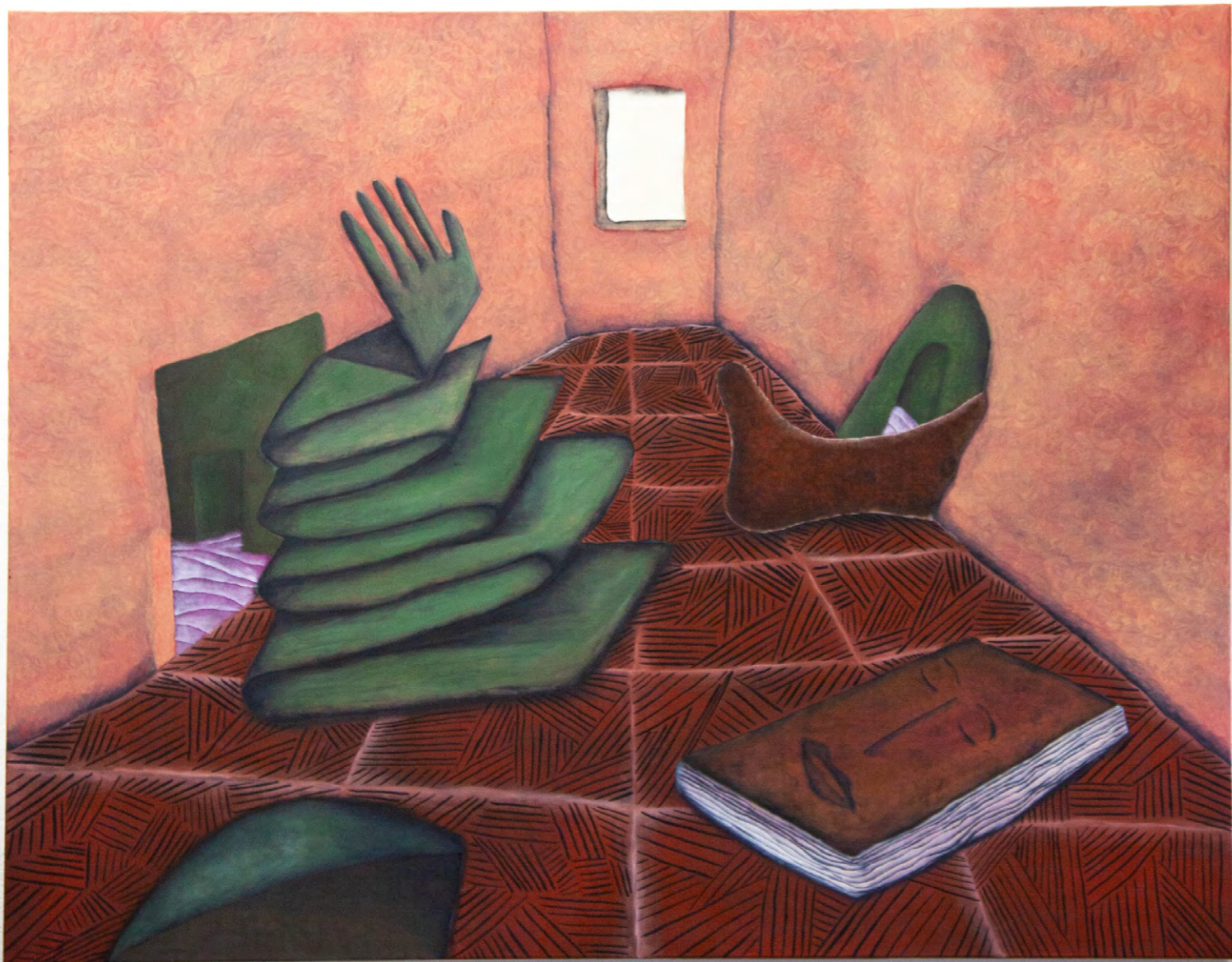
Homestory VIII, 2024 oil on canvas 140 x 180 cm