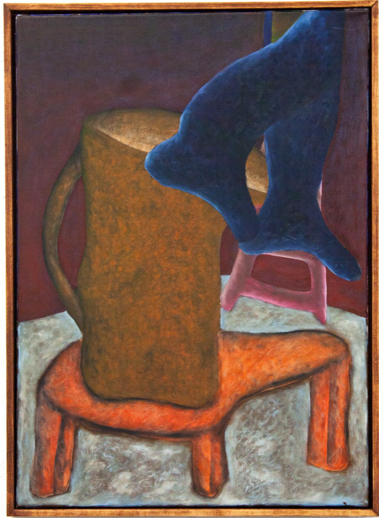
Time is flying, 2024 oil on canvas 70 x 50 cm