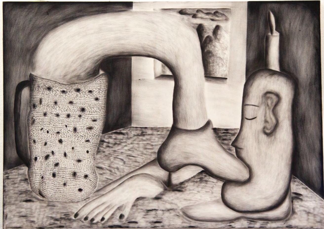
Homestory VIII, 2024 oil on canvas 120 x 160 cm