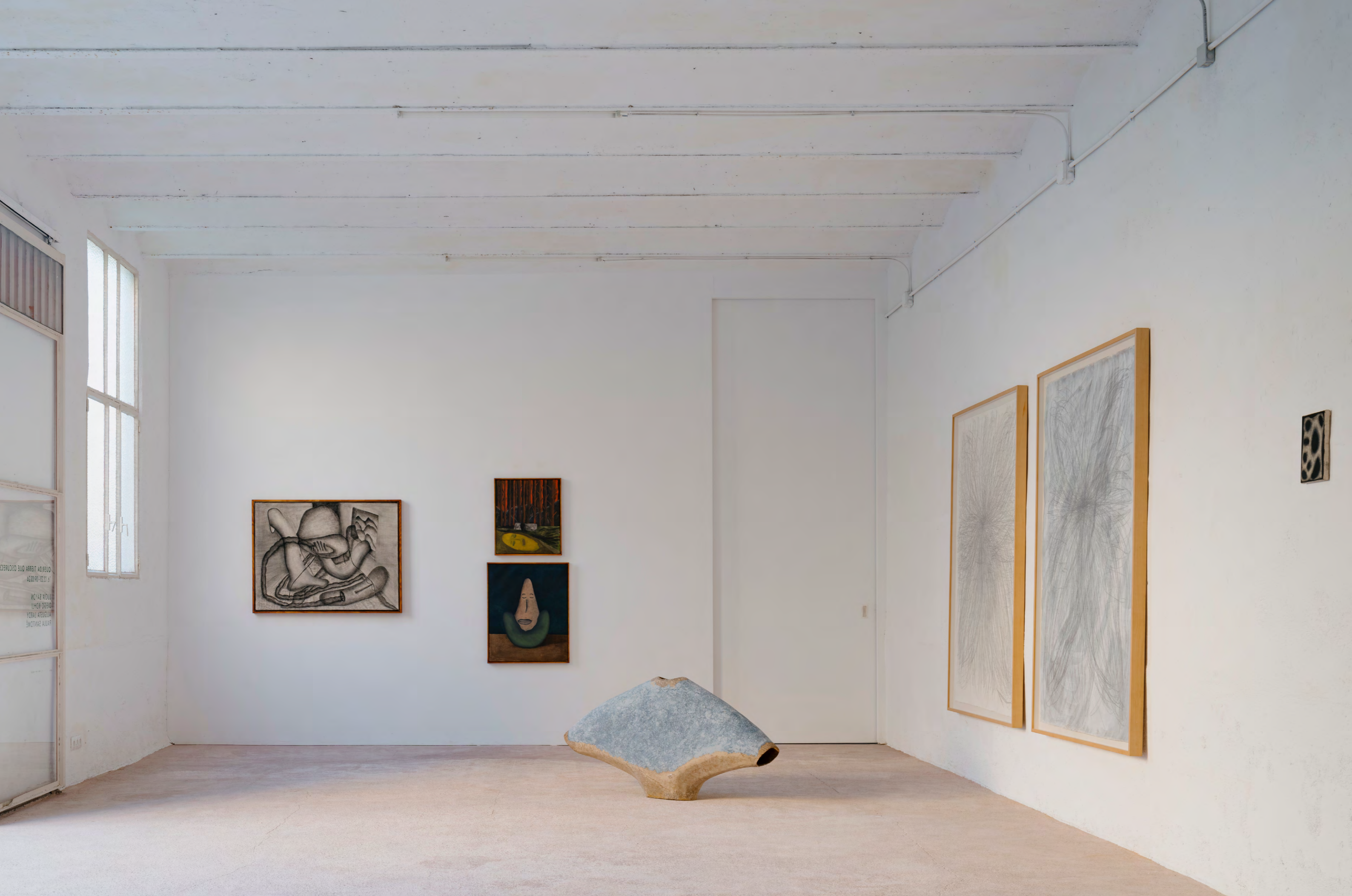
Exhibition view: Querida tierra que oscurece, Gallery Belmonte, Madrid (ES), 2023