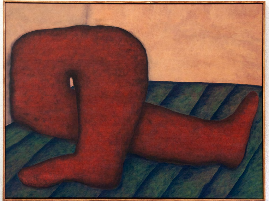
Homestory III, 2024 oil on canvas 95 x 125 cm