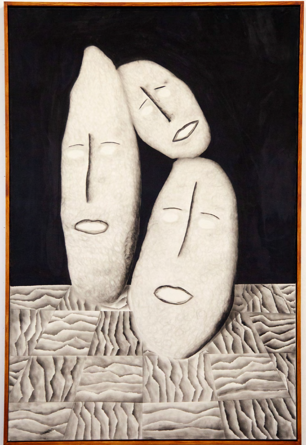
Hermanos, 2023 oil on canvas 180 x 120 cm