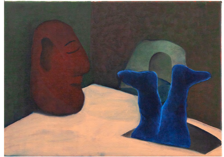
Soñar sin meta, 2024 oil on canvas 36 x 50 cm